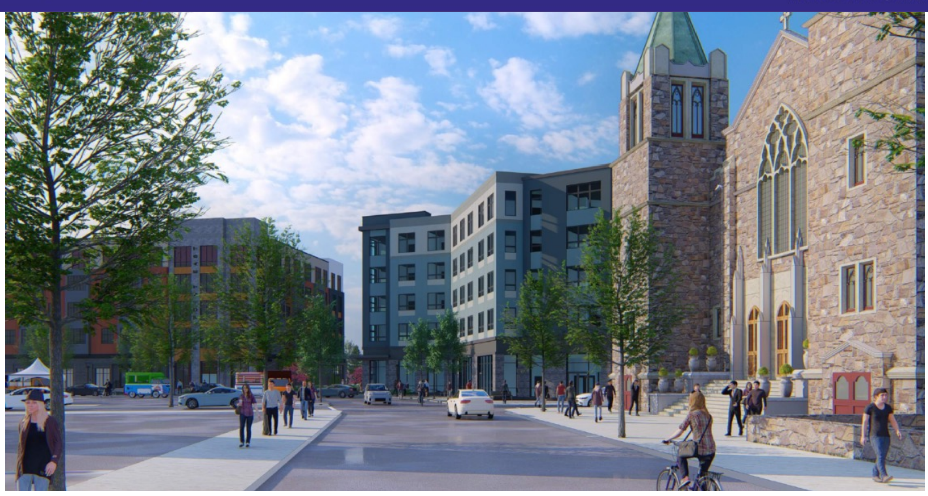
Perspective View from Traverse Street