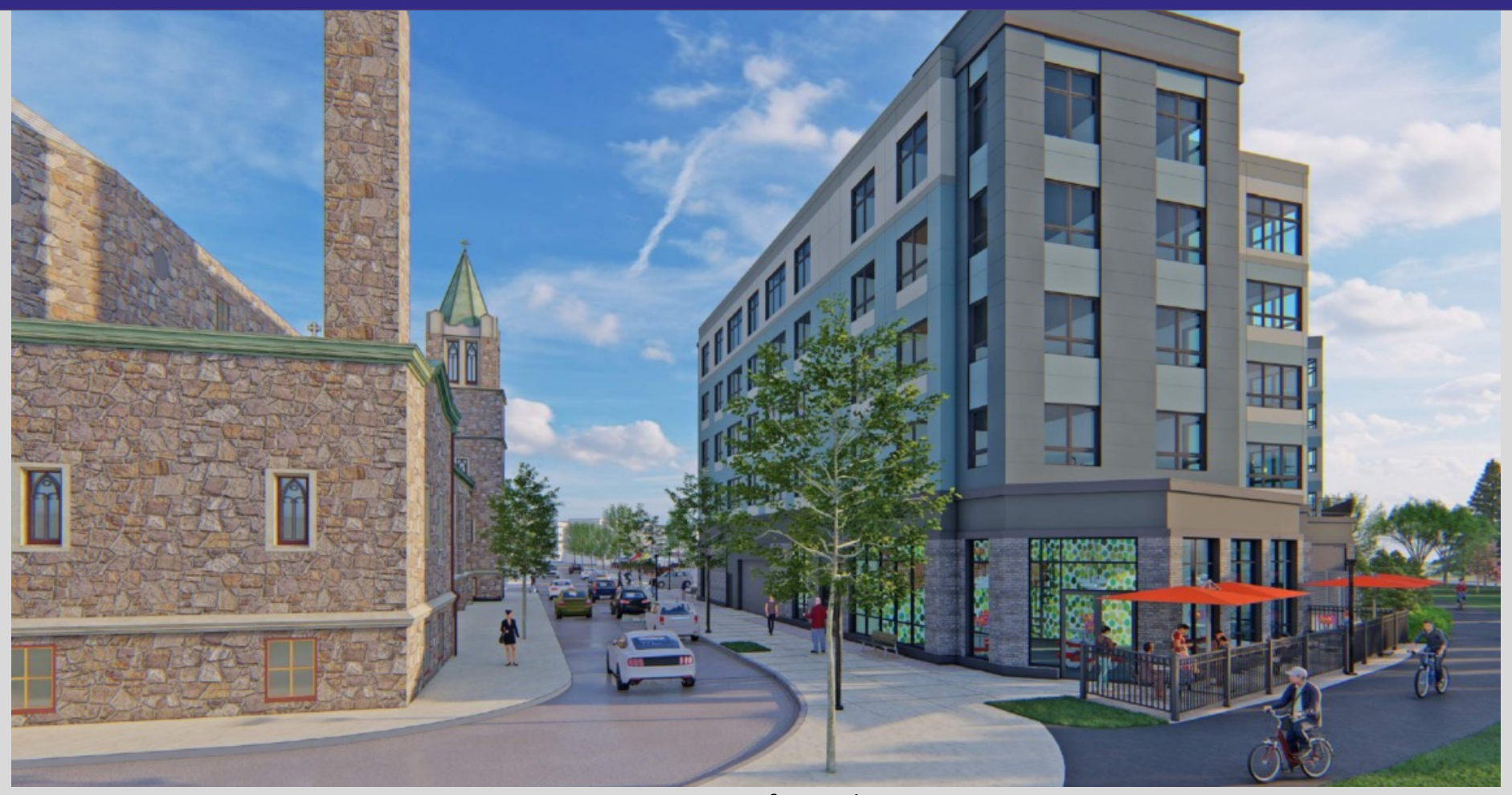
Perspective View from Alves Way