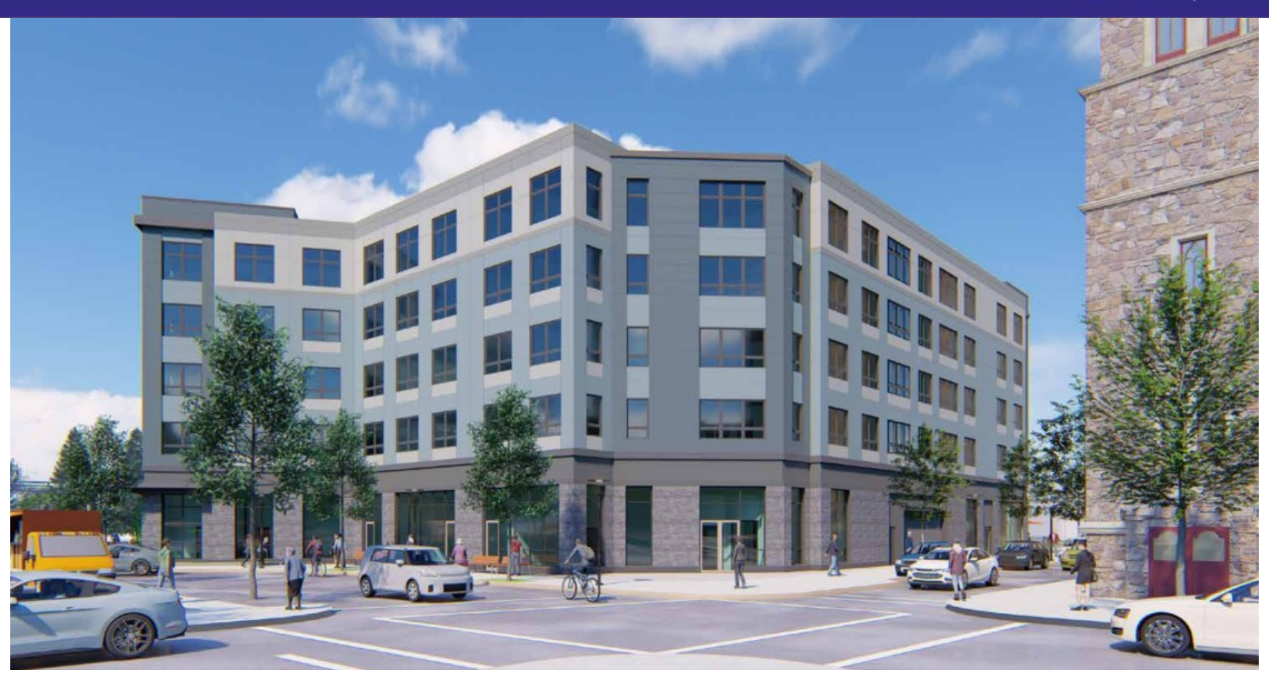
Perspective View from Traverse Street